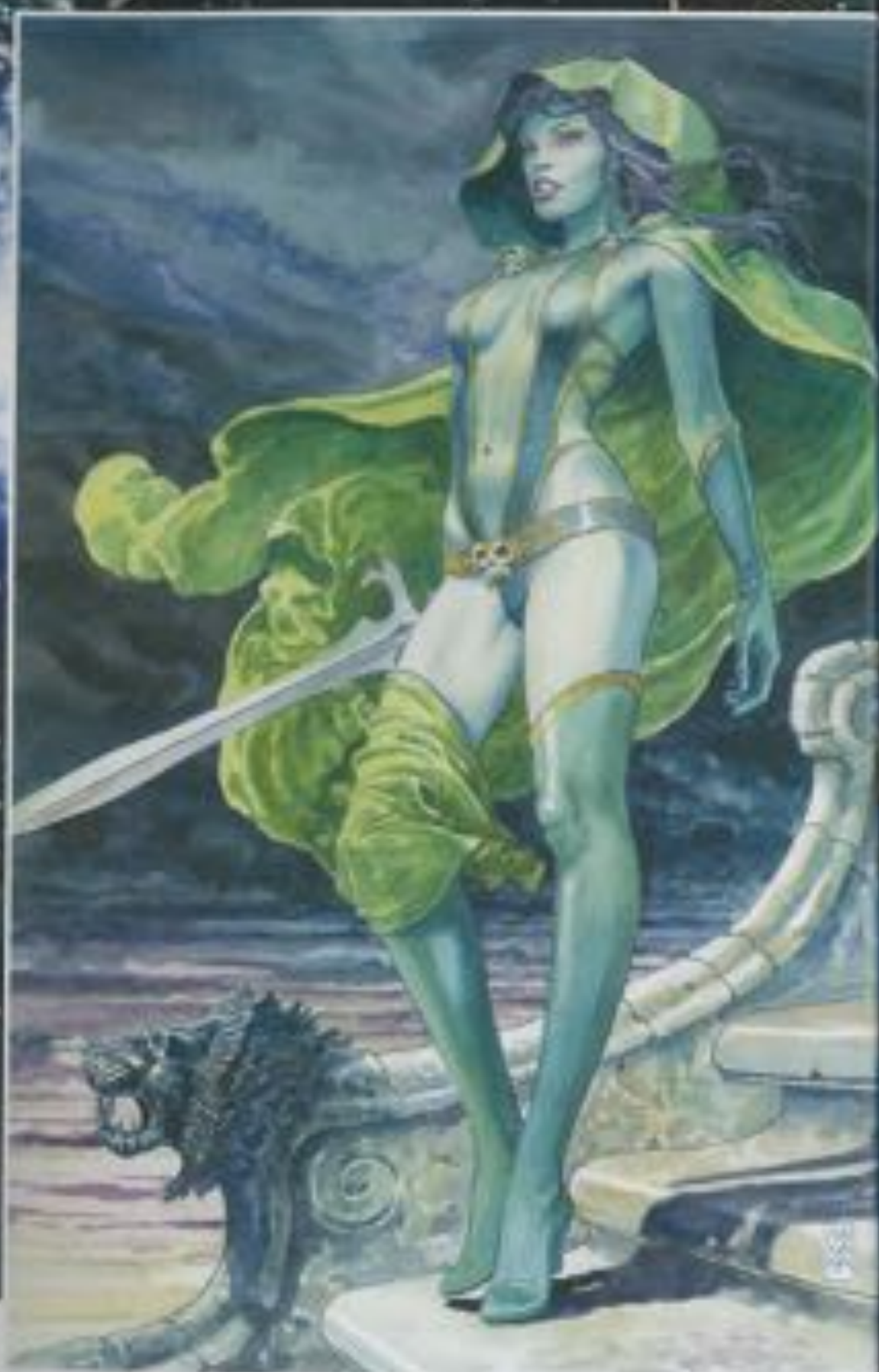
#12 VARIANT BY MILO MANARA